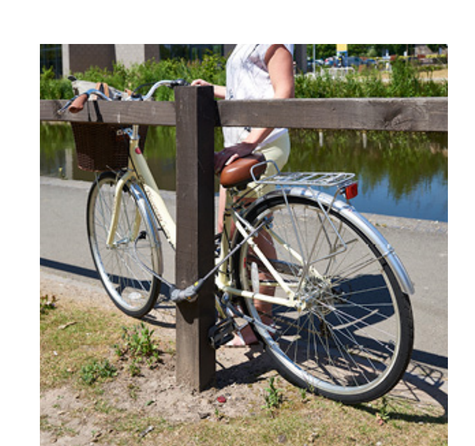
Easy to carry around

This keyless cable lock resists picking & pulling with its steel ball combination gear system.