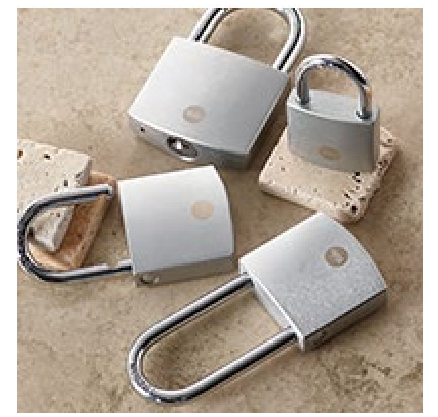
Exclusive Yale design

Even that special bike can be kept safe and secure in your garage with a Boron shackle to prevent cutting and double locking for added security, built with you in mind.