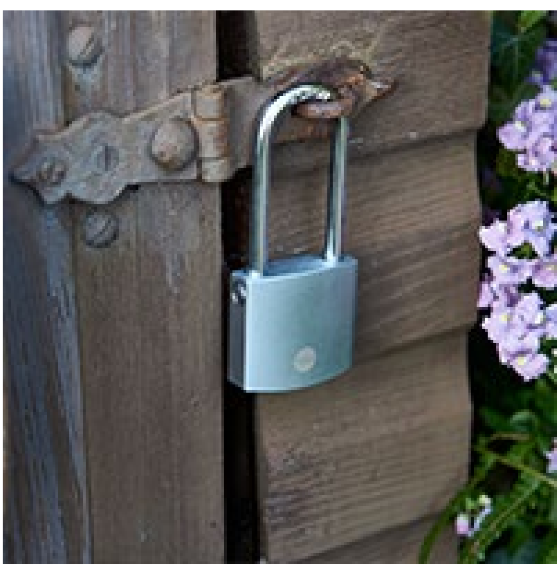
Designed for outdoor usage

With 180 years of manufacturing expertise, we are introducing our padlocks with an exclusive Yale design and tested to EN12320:2012 standard for added security and reassurance, built with you in mind.